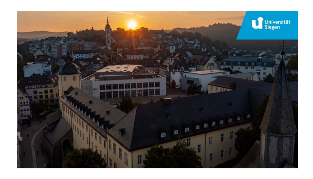
Campus "Unteres Schloss" (US) – Hörsaalzentrum (US-C)