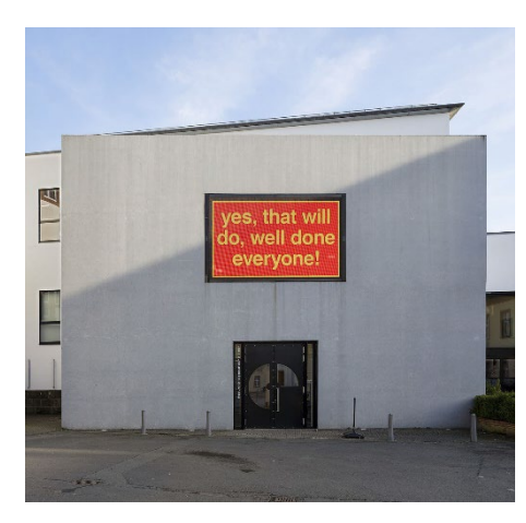
© Nora Turato (LED Screen)

The reception and award ceremony as well as the reading with Lucy Caldwell will take place at the gallery of contemporary art ("Museum für Gegenwartskunst Siegen"), which is located next to the "Hörsaalzentrum".