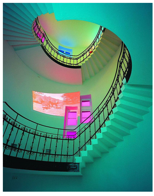
© Diana Thater